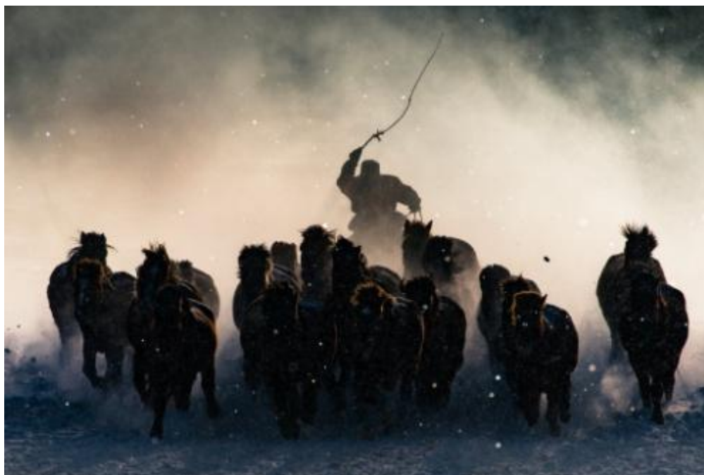
Grand Prize Winner: Winter Horseman

2017 Silver and Bronze Awards in the ESPON International Pano Awards