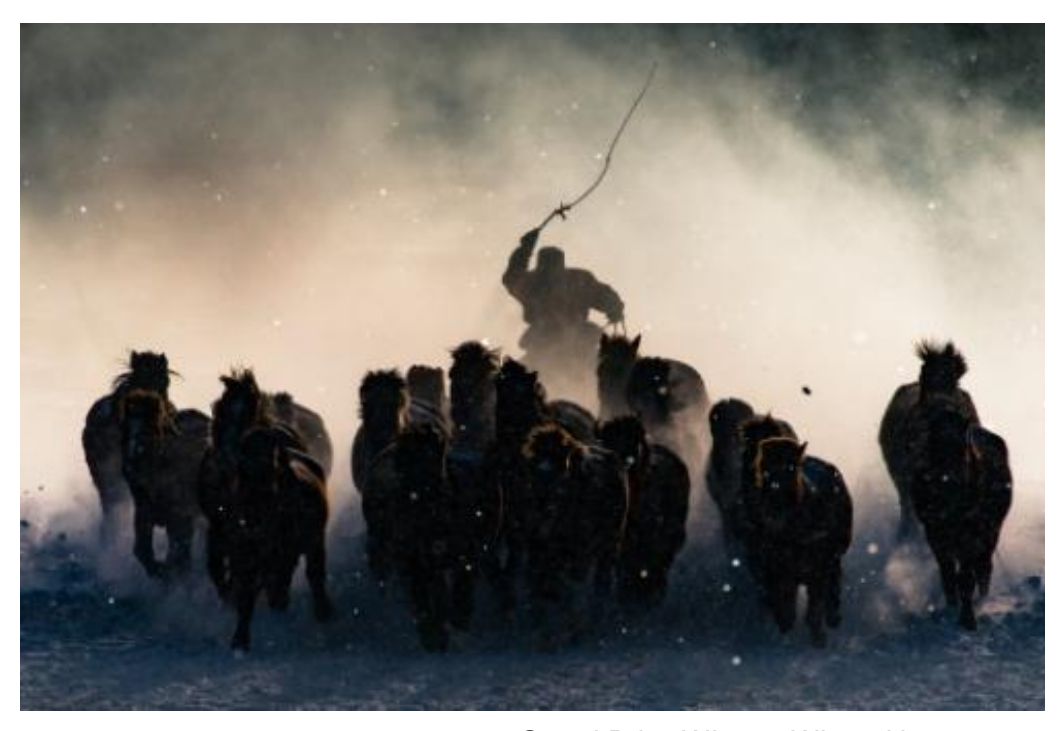
Grand Prize Winner: Winter Horseman

2016/17 Fine Art Photography Awards: Nominee in Abstract and Travel Categories